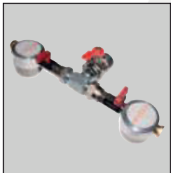
Straight Tee AC.TFK.ST