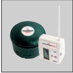
Watchman Sonic GA.WA.ST