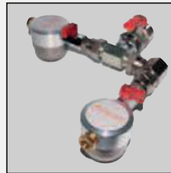
90° Tee AC.TFK.90T