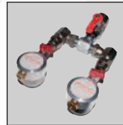
Parallel Tee AC.TFK.PT